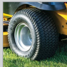
LARGE DRIVE TIRES Provides a smoother ride experience. The FasTrak SDX offers up to 23" drive tires.