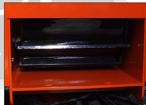
WIDE IN-FEED OPENING

The jack easily raises the feed roller for fast and easy in-field servicing; Anvil is mounted on the side of the chipping chamber for easy access and has two jacking nuts for a fast, easy and positive adjustment