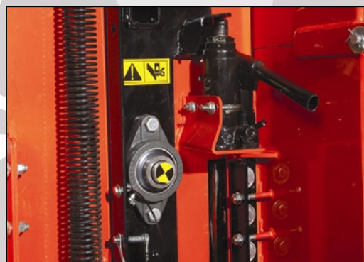
HYDRAULIC JACK & SIDE ANVIL

The jack easily raises the feed roller for fast and easy in-field servicing; Anvil is mounted on the side of the chipping chamber for easy access and has two jacking nuts for a fast, easy and positive adjustment