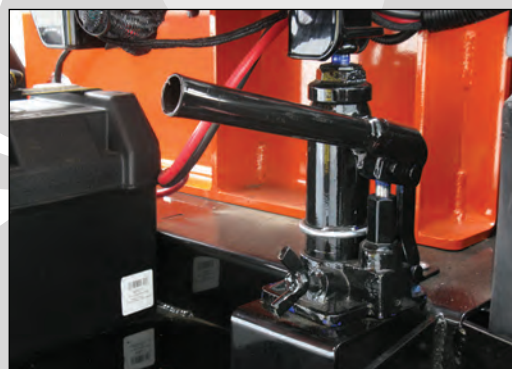
ON BOARD HYDRAULIC JACK The on board hydraulic jack easily raises the feed roller for fast and simple in-field servicing.