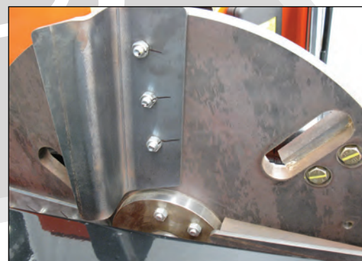
QUICK EASY BLADE ACCESS Easy access to the 125kg disc with the four reversible blades. The blades are very simple to turn and don't require constant adjustment like some chippers. The extra large airflow paddles stop blocking even in the wettest conditions.