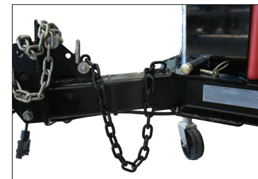
EASY TO ADJUST DRAW BAR The draw bar is quick and simple to adjust - just remove one pin to change the length. This makes reversing a lot easier down narrow driveways.