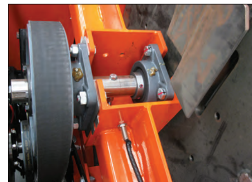
CANTILEVER DISC The unique cantilever design eliminates fibrous material wrapping around the shaft and bearings providing longer bearing life and less downtime.