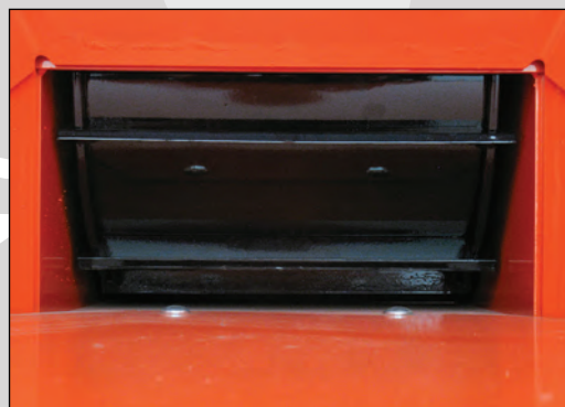
WIDE IN-FEED OPENING A large rectangular 6.5" high x 13.5" wide in-feed opening boosts productivity by reducing the need to trim material before its fed into the chipper.