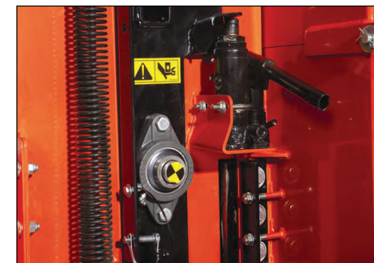
HYDRAULIC JACK & SIDE ANVIL The jack easily raises the feed roller for fast and easy in-field servicing; anvil is mounted on the side of the chipping chamber for easy access and has two jacking nuts for a fast, easy and positive adjustment.